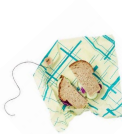
Bees Wax Wrap