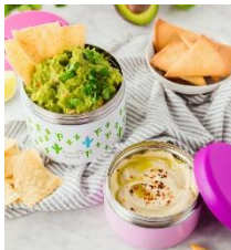
Metal container with Lid